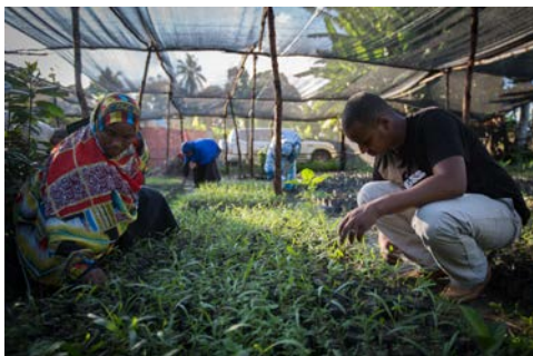
Kokota: The Islet of Hope