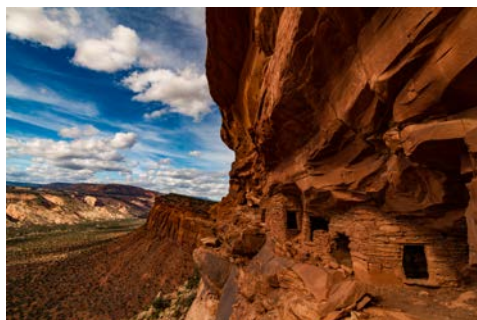
The Beauty of Bears Ears